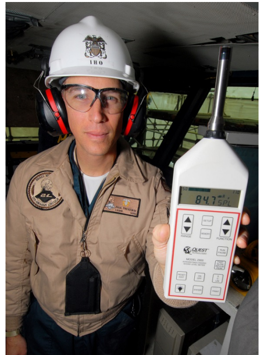
A Navy officer uses a sound level meter to test for high decibel levels.