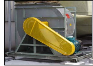
The image shows a machine guard covering the rotating parts of the pulley to reduce employee contact and exposure.

For additional information on the SMCX’s services, please visit the SMCX-hosted website at: https://www.smscx.org/ .