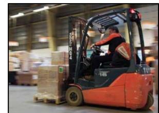
The image shows an electric powered industrial truck in use rather than a gasoline or diesel vehicle emitting exhaust gases and particulates.