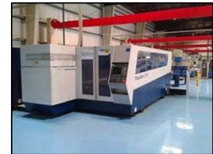
The image shows an enclosed booth, eliminating the need for hearing protection during this process.